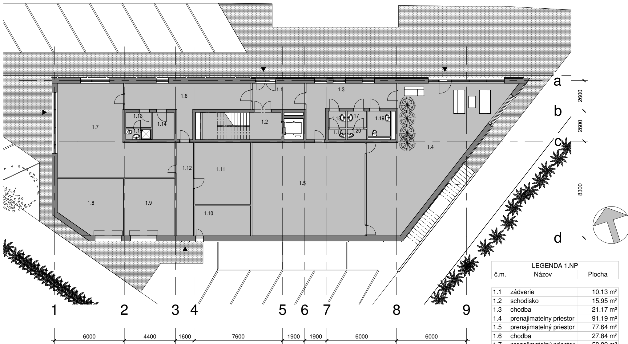
2 1.NP 1 : 200